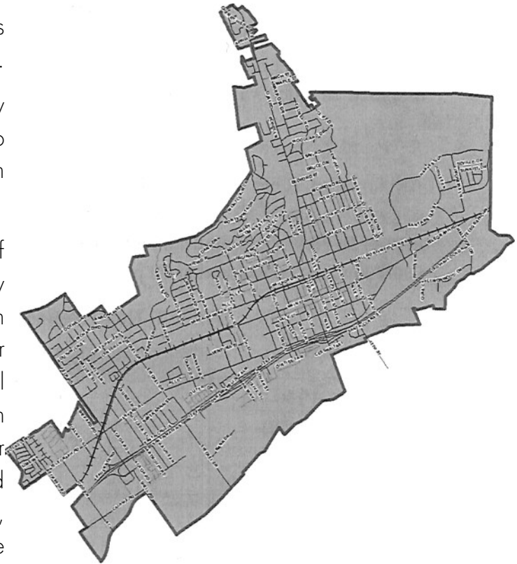
Figure 1. City of Santa Paula Road Network

All road segments provided by the City of Santa Paula have been previously visually inspected using Metropolitan Transportation Commission pavement inspection user guidelines and standards. The visual inspections were performed to obtain an updated pavement condition index (PCI) for each road segment. The current weighted average network PCI as of February 21, 2022 is 52. The network PCI based on the previous inspection from 2019 was 47, this is an increase of 5 points in the past 3 years.